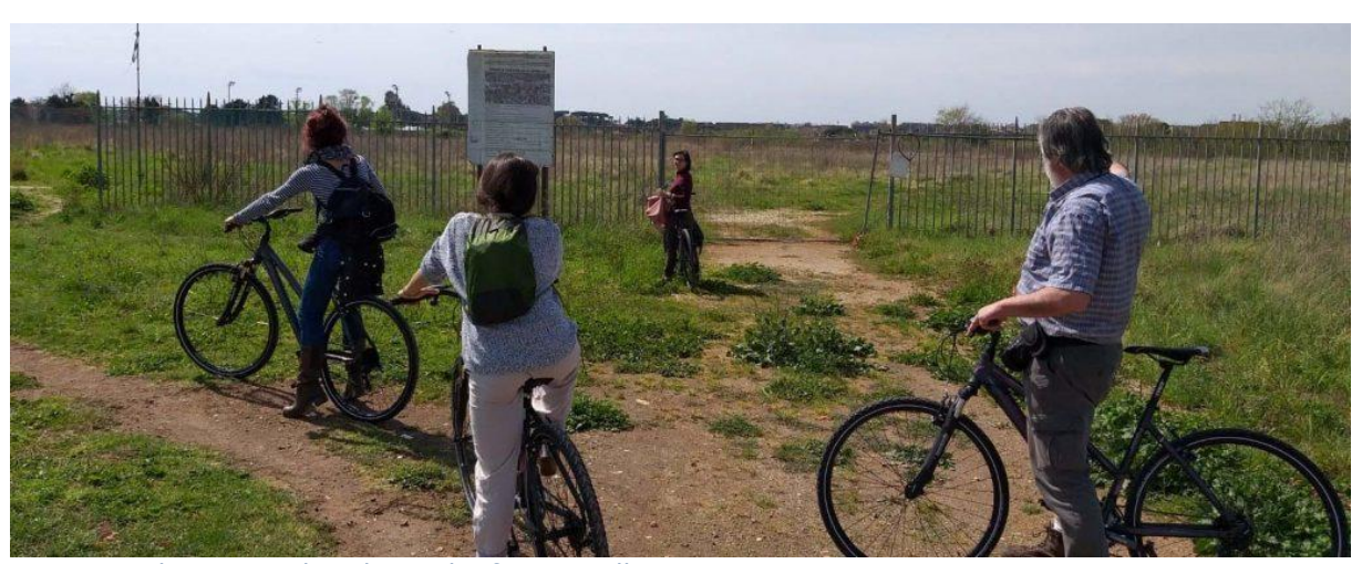
Figure 1 Bike tour within the Park of Centocelle

In addition, the LAP foresees also more direct action. In particular, the community is committed toward the regeneration of the Tunnel of Centocelle, making it accessible to the community. The community has already organized several site visits in the tunnel of Centocelle, which despite its historical relevance and folkloristic impact, is in a state of complete neglect. The tunnel has been used to illegitimately dispose garbage (i.e. sofas, mattresses, fridges, etc.) making the state of the tunnel dramatic, despite its enormous cultural and narrative potential. Therefore, the heritage community is constantly reaching out to the local authorities to see the possibility to receive the permission to clean the area and to manage (temporarily or on a more stable and longer-term) one or part of the heritage sites within the heritage district of Centocelle.