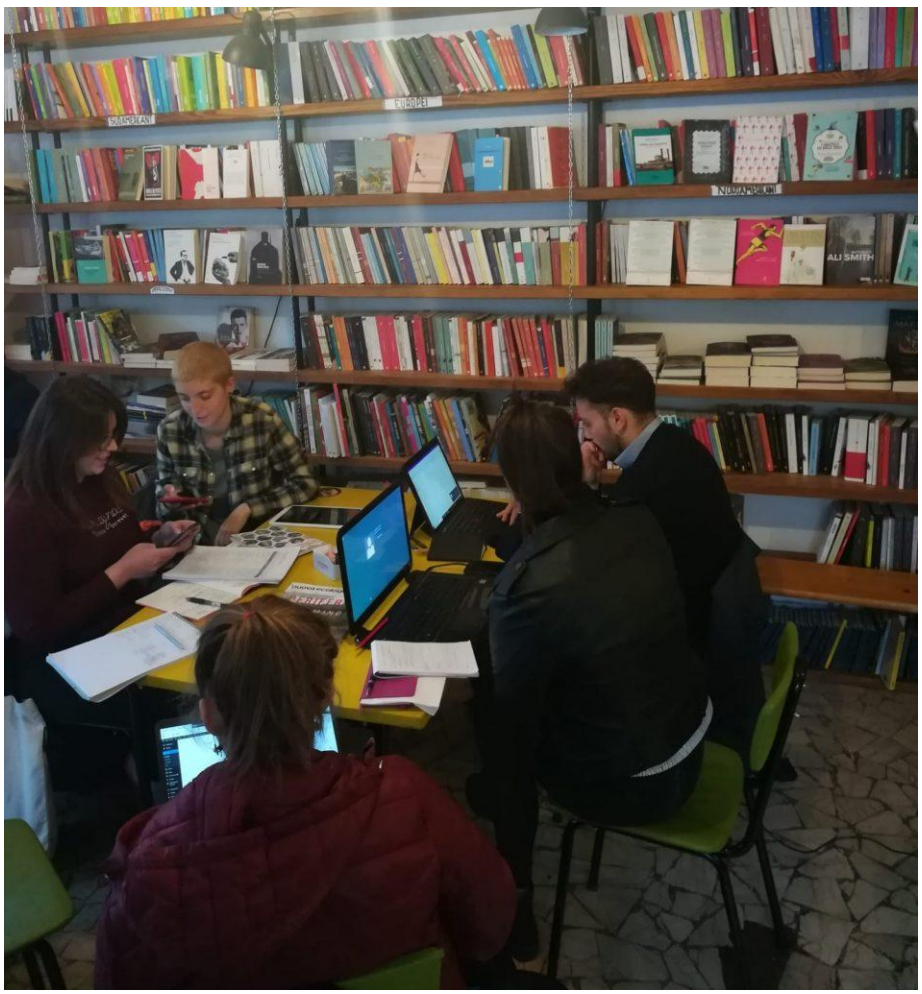
Figure 2 Co-Design session at Pecora Elettrica, Centocelle

more and more people into the process and consequently higher visibility of the meetings.